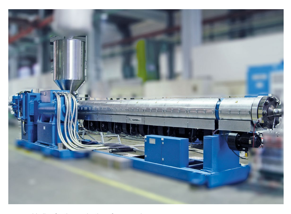
7.5 m wide line for the production of geomembranes

age of chemicals, water tanks, canals and dikes, but also irrigation ponds or for the production of raw materials such as copper and more.